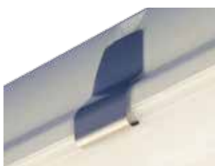
Stainless steel clips as standard

Diffuser made of highly transparent UV-stabilized polycarbonate Stainless steel clips as standard LED colour temperatures 3000K or 4000K High colour rendering index CRI < 80 Long life time of 50,000 hours Tridonic LED modules c/w 5 year warranty